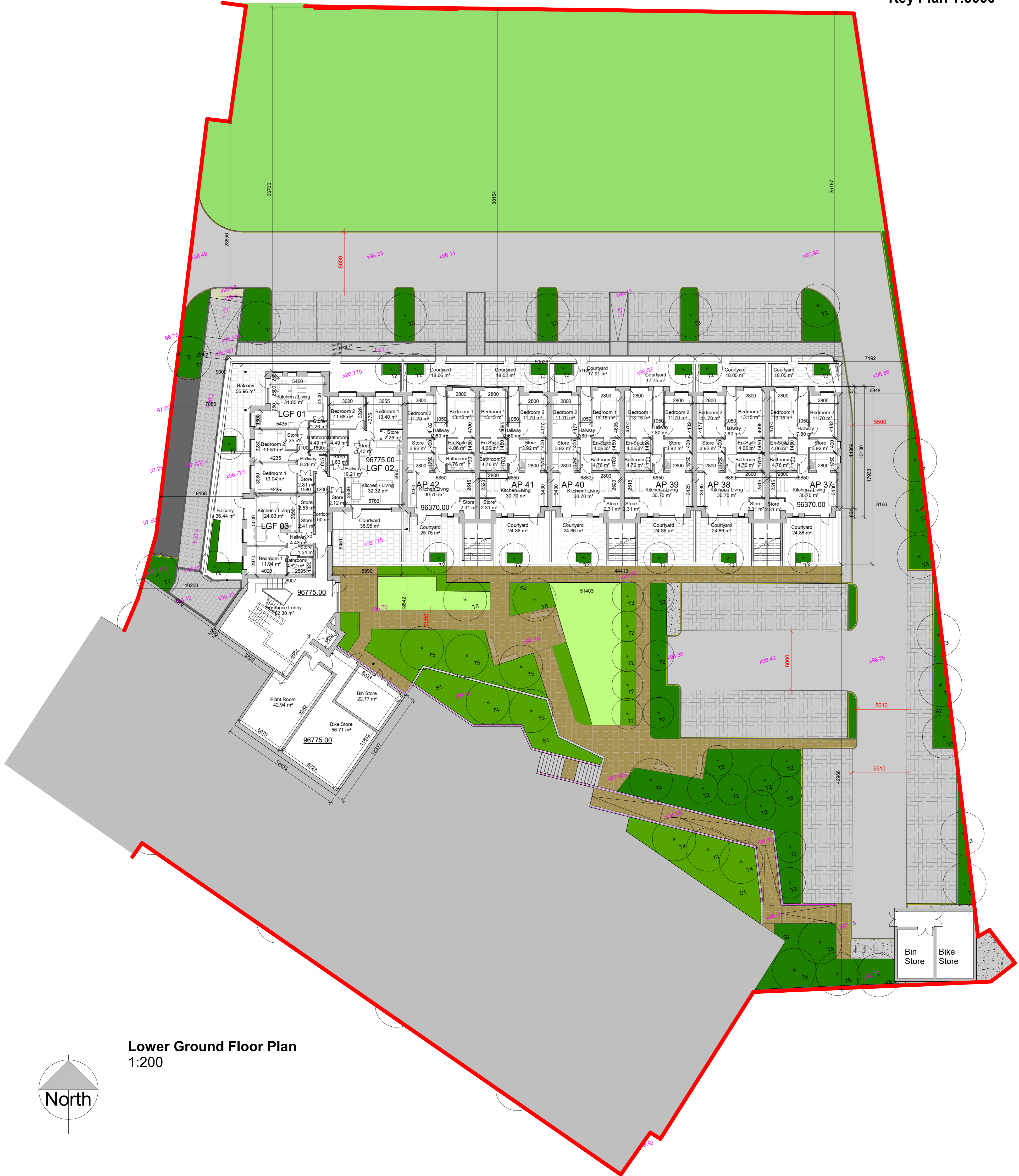
Lower Ground Floor Plan 1:200